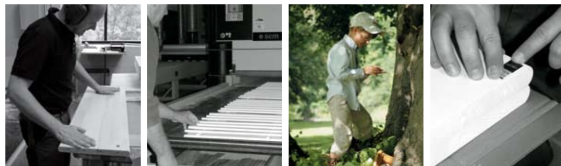
Modern babybed with HCA baby textile – dove blue

All our products are made of solid and knotless pinewood of best quality – produced in Denmark at own factories. As SMALL WORLD attaches great importance in taking care of the environment, we use the most clean and environmental friendly surface treatment on the market.