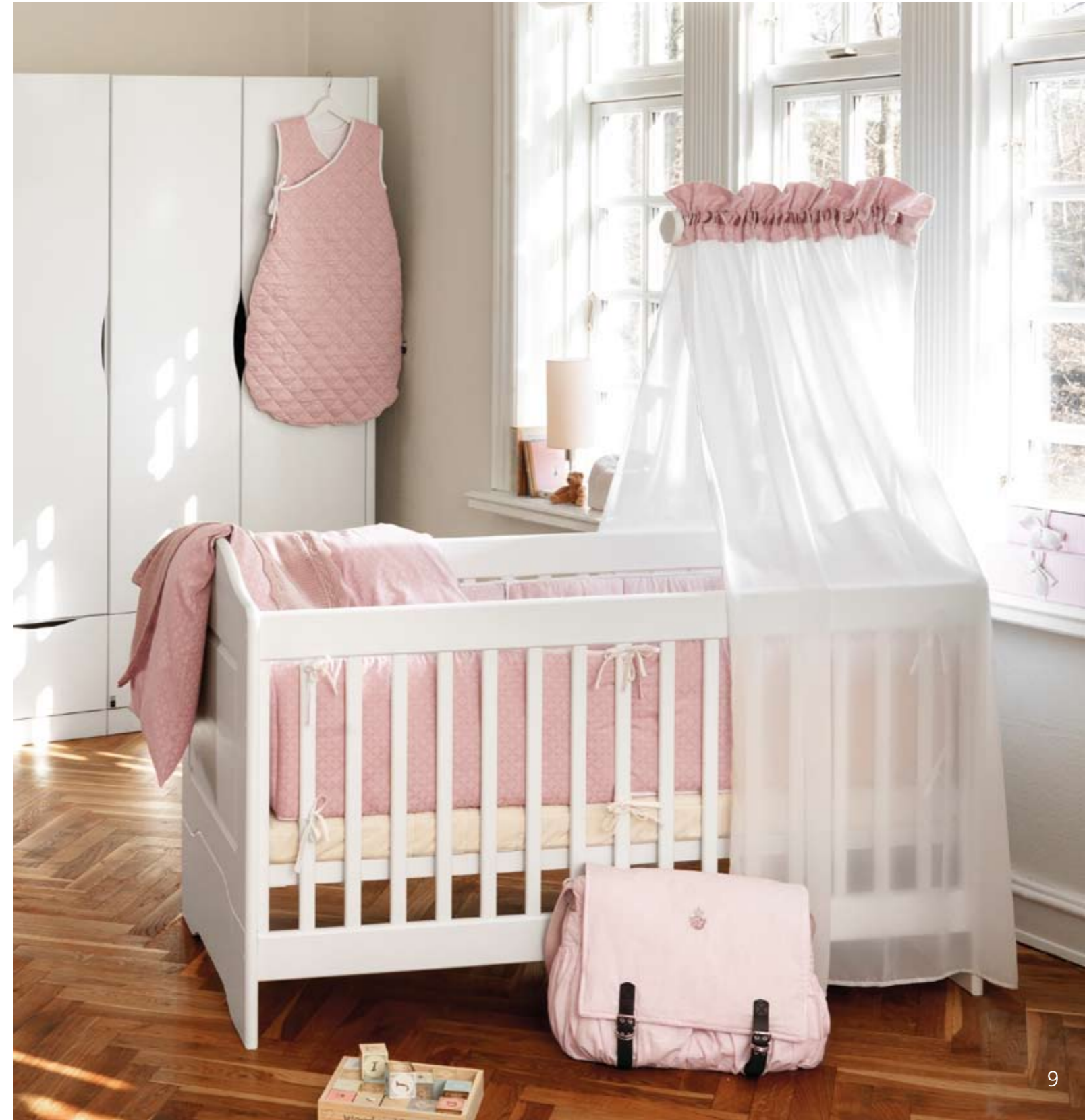
Left top and on right side: Classic baby room in full painted white (x-combination).