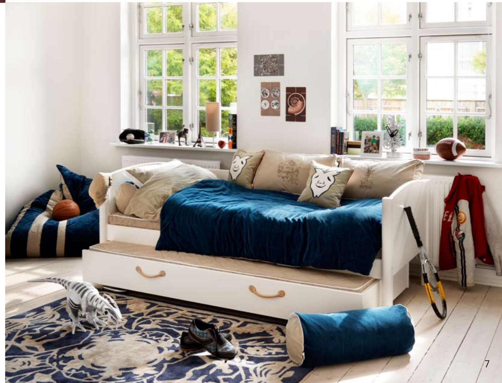
Textile: HCA tweens.