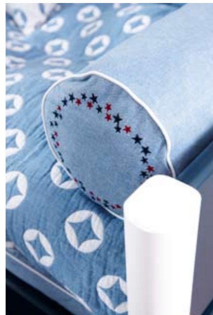
Left side: Basic couch with 2 drawers in royal blue/full painted white (colour 74) with Jeans for tweens textile in jeansblue.