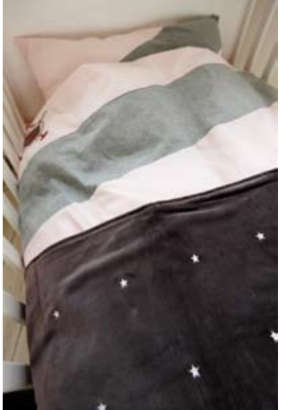
Basic baby room in full painted white.